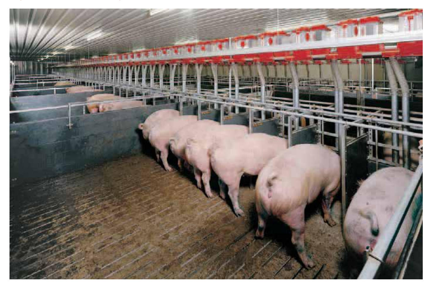
Figure 7. Trickle feeding system