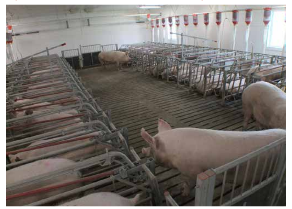
Figure 3. Free-access stalls with an "I" configuration