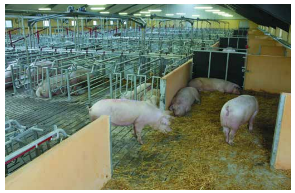
Figure 4. Free-access stalls with "T" configuration