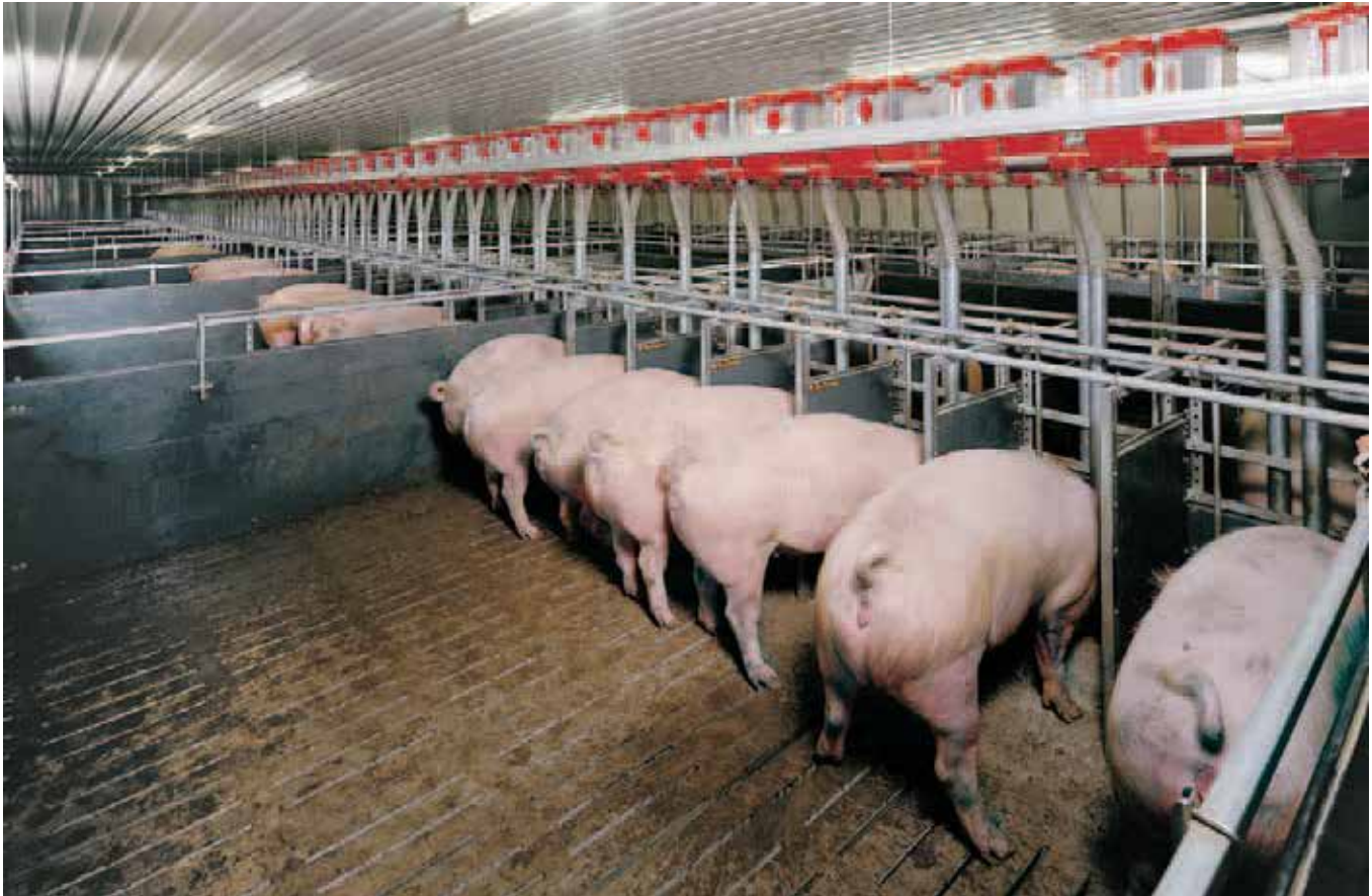
Figure 7. Trickle feeding system